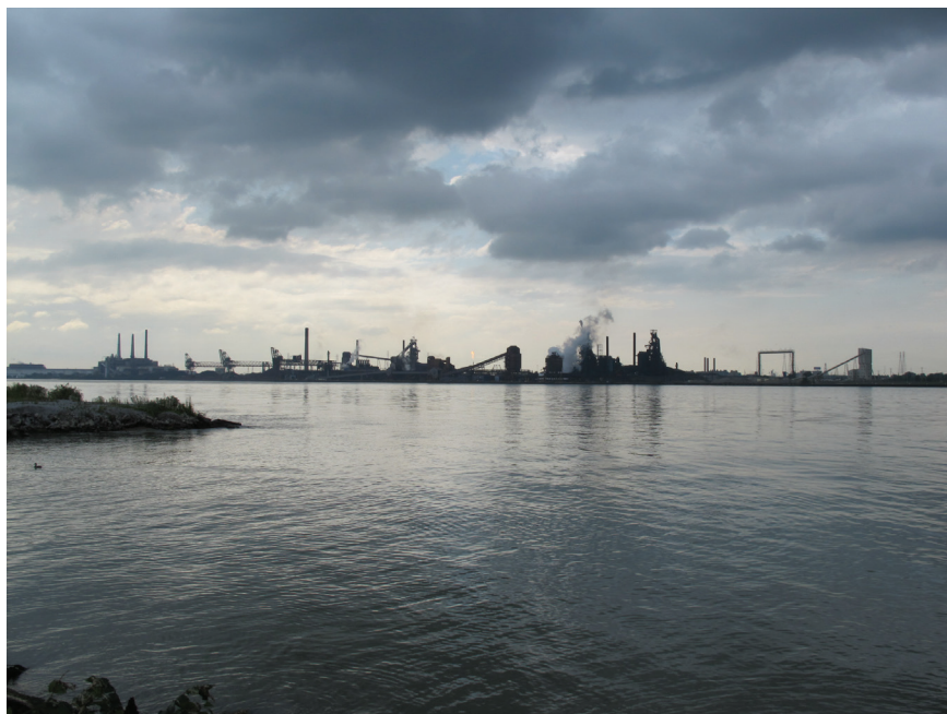
FIGURE 7.3. View of Zug Island from vantage point at old ferry terminal in Sandwich.

injury,” a contemporary observer has written. 30 A place out of sight and out of mind, many well-established citizens of Windsor characterized Brighton Beach as a “dog-patch,” a marginal and abused place. 31 The predicament of Sandwich paled beside the accumulating neglect of this location. In different ways, both communities were caught in a process of developing underdevelopment, lingering on the periphery of the rising City of Windsor to the east, where many were eager for more fabulous routes to the river, the border, and the international markets beyond.