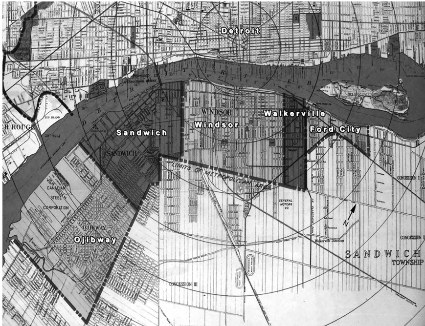
FIGURE 7.1. Map showing the border cities, including the proposed development of Ojibway. Federal Map of Detroit and Environs (c. 1920).

market. 12 The County of Essex encompassed the border towns, and its elected officials were still promoting farming and gardening as land uses in “the Sun Parlour of Canada” in 1912. Market gardening and soft-fruit production were sufficiently remunerative in the climate and soils of Essex to support such contemporary Canadian countryside rarities as municipal telephones and free rural mail-delivery service. The townships of Sandwich East, West, and South—where “peaches grow to perfection,” “among garden lands, which grow radishes, potatoes, sweet corn, tomatoes, and all kinds of vegetables”—surrounded the towns of Sandwich, Windsor, and Walkerville. The central part of Sandwich West, stretching from the town of Sandwich southward, was “noted for the quantities of melons marketed every year, and the balance of the township for its fine corn land and other field grains.” 13 In what