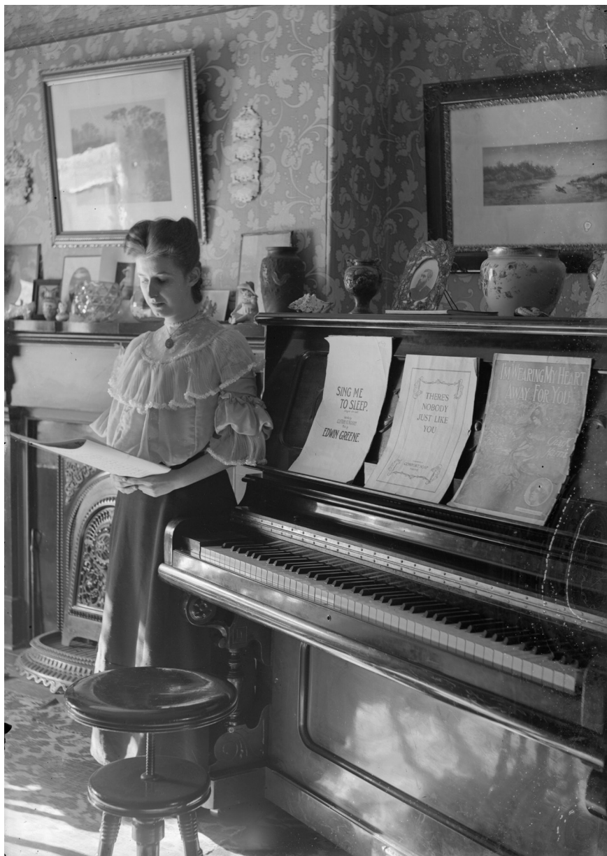
Many bachelors wanted a wife who was musical. A woman who could play the piano was therefore highly desirable.