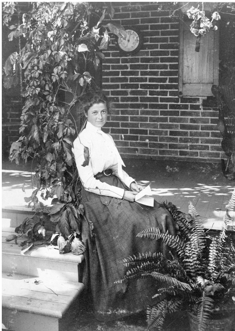
Based on her prim and proper appearance alone, this Erindale, Ontario, maiden would have met most men's definition of the ideal woman in the pre-war years.