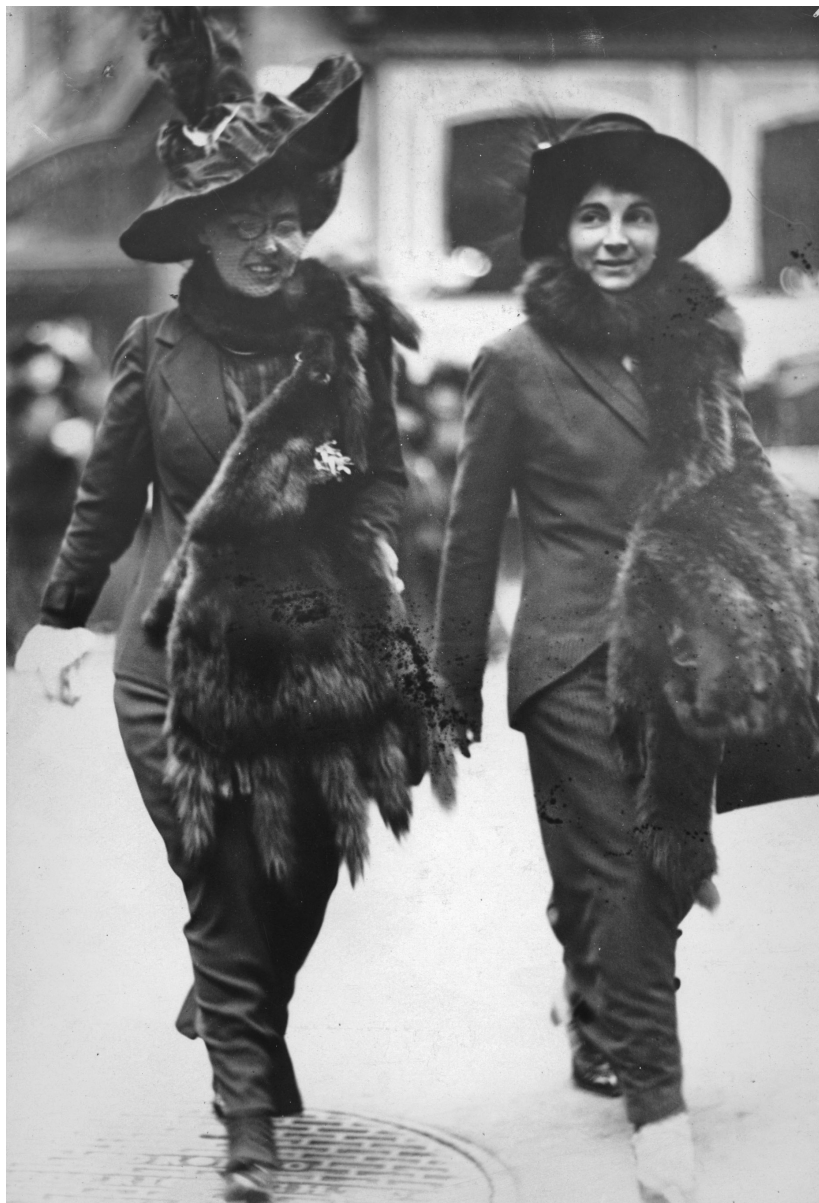
These feather- and fur-bearing women, crossing a Toronto street in 1911, might have held some appeal to their city's more superficial bachelors, but most men, especially in rural areas, deplored the extravagance.