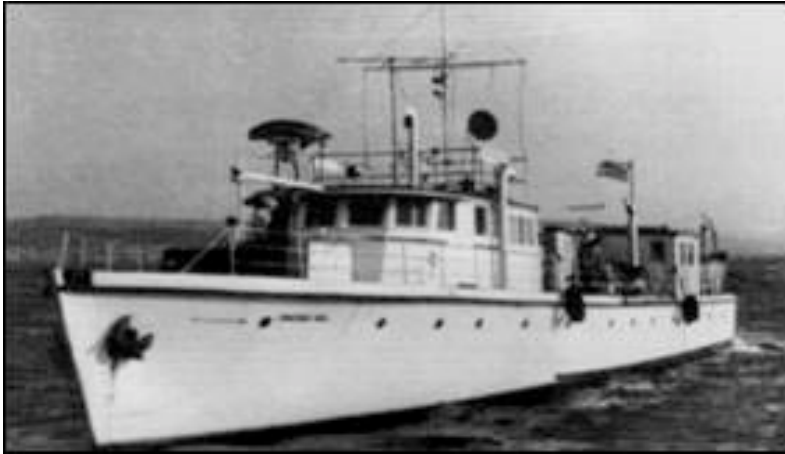
Figure 1: The MV Christmas Seal , as seen leaving Port de Grave on its last trip as an X-ray clinic, Oct. 1970.

One of the greatest battles ever to take place in Newfoundland took almost hundred years to resolve. In that time no shots were fired, no blood spilled, no bands headed long lines of marching troops, and no troopships plied the seas. The battle was fought right here against an invisible enemy who attacked young and old alike. A microscopic scrap of life was the enemy, for it was a virus, spread from one person to another that made tuberculosis a dreaded killer. 1