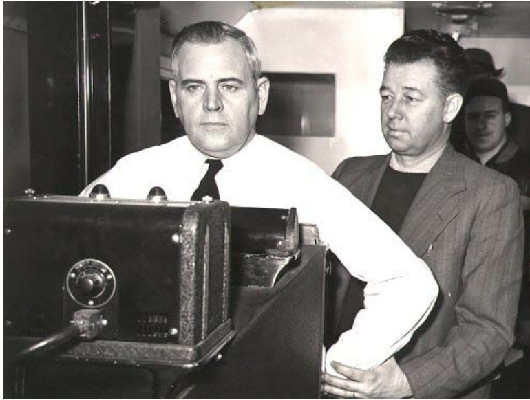
Figure 4: A man being X-rayed during a community survey. As the surveys progressed, they became more efficient; as seen here, participants were eventually able to remain fully clothed during the X-ray.

for Diabetes Mellitus Type II), a physiotherapist and social worker from the Newfoundland Society for Crippled Children and Adults. 28