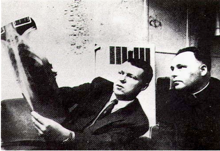
Figure 3: A Doctor onboard the MV Christmas Seal , interprets an X-ray in the summer of 1954.

X-rays being taken, often more than one X-ray per minute. 25 Those patients who were called back for a second X-ray were seen by the doctor who would read the film in the boat lounge. When active TB was found, arrangements had to be made immediately for admission to a sanatorium. 26