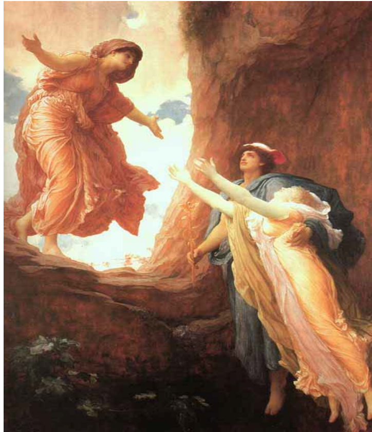
Figure 2. “The Return of Persephone,” by Frederic Leighton, 1891, http://frederic-leighton.org/The-Return-of-Persephone-1891.html.