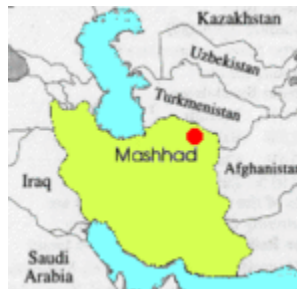
Map 1: Geographical location of Mashhad

Source: Saber moghadam, F, Hesari P. An Overview of Holy Mashhad Tourism. Mashhad, 2008