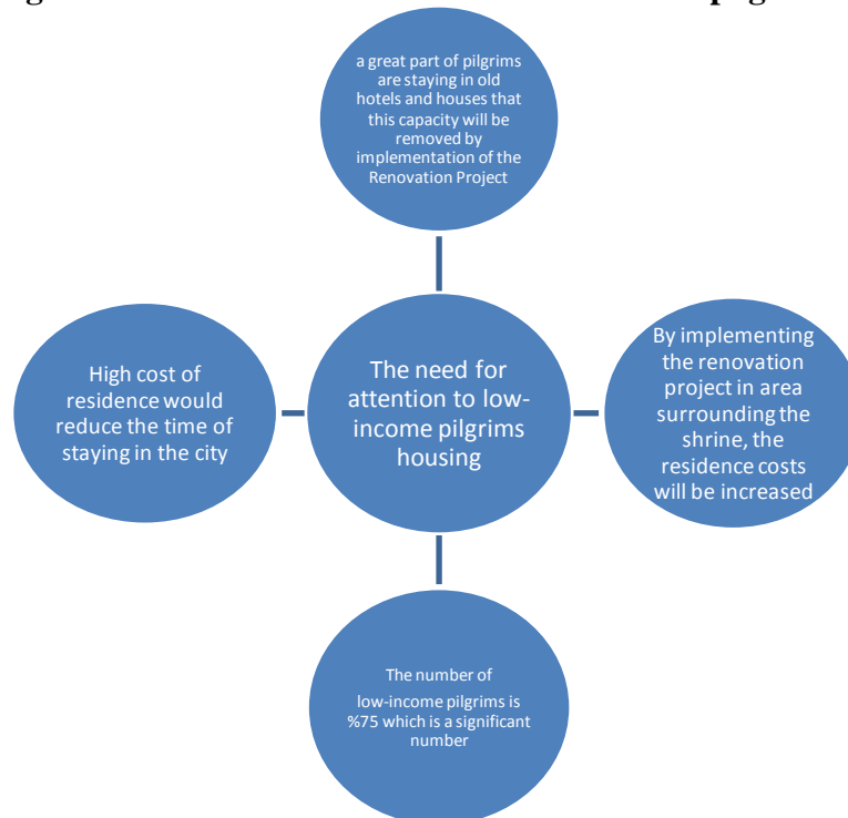
Figure 1: The need for attention to low-income pilgrims housing

Besides official residential centers in the city, some people rent the extra rooms in their own houses to the pilgrims, and earn a substantial income in peak days. Another way of pilgrims' settlement is to stay in places that are managing by religious and charitable institutions. Accommodation costs in these centers are very low and even sometimes are free. The studies of planners and economists suggest that much of the pilgrims and travelers to the city of Mashhad are low-income people of the community, so urban managers decided to pay more attention to the low-income tourists and construction of affordable residential units. The following chart shows the need for attention to low-income pilgrims housing.