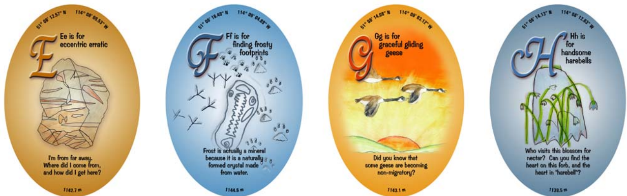
Figure 2. Four examples of the Alphabet Panels

The urban prairie conservation initiatives I have been involved in are testament to the bringing of people together around complex issues, deriving a coherence within a collection of multiple perspectives, deriving themes and elucidating threads without compromising the individual voice, and presenting the results in a compelling way. As a set, the Whispering Signs speak closely to the complexities of our ecological context and our place in the web of existence, especially at the precious and precarious intersections of our natural and built environments.