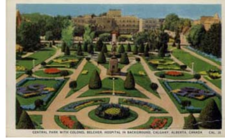
Historic Post Card of Central Memorial Park, ca. 1930's

Central Memorial Park is Calgary's oldest surviving park and was typical of civic parks and squares in both Canada and Britain during the late 19th and early 20th centuries. The existing design dates from 1912 when Calgary's first library was built on the site. The park is a Victorian era inspired park encompassing an entire city block (2 ha - 5 acres). The formal layout is designed around a central oval of symmetrical lawns, flower beds and paths. It is described as a design elaboration of geometric carpet beds (Graham, 1989) and is still intact today. To emphasise the