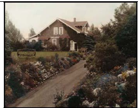
House through the Garden, ca. 1930's

Reader Rock Garden is an Edwardian era, arts and craft style rockery that consists of a matrix of rock paths, steps, and walls that form numerous planting beds. The 1.2 ha (3 acres) Garden dates from 1913 and was historically used as a private residence and accompanying garden for William Roland Reader, Calgary's most influential Park Superintendent. Reader used the Garden to test a wide variety of plant material and under Reader's care the Garden held over 4000 different plant species (Graham, 1989). Reader wrote an unpublished book, The Hardy Herbaceous Perennial Garden , which lists, bed by bed, the