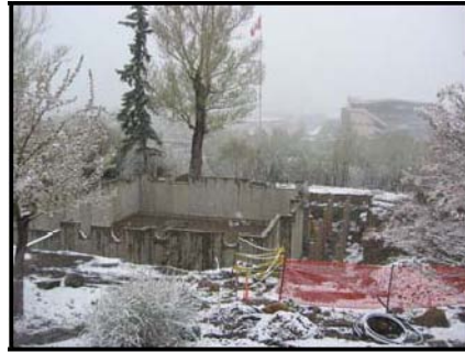
Foundation for reconstructed Cottage at Reader Rock Garden, 2004

The reconstructed cottage was designed to house a small restaurant and classroom space for school and adult programs.