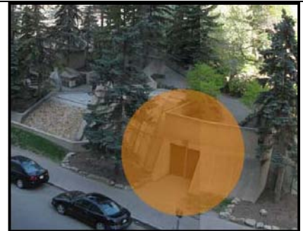
Door to Parks Office at Century Gardens, 2007

The structure at the southwest corner of Century Gardens is viewed by some as a safety concern - the elevated portion from street level and the retreat/respice areas are seen as places where illicit activity can occur. The original impulse was to demolish the structure but referring back to the built features and new additions section within the Standards and Guidelines the decision has been made to alter to original structure to have more surveillance in the park. The Parks office will be opened to create a stronger relationship between the office, the park, and the street. Again the new additions section offered only minor guidance.