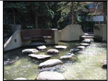
Stepping Stones at Century Gardens, 2007

The circulation system at Century Gardens includes a set of rock stepping stones that allow a park user to walk over the water. These rocks have been identified as unsafe but the safety consideration section is primarily about meeting codes and does not have any specific recommendations for landscapes. A decision has been made to chain the area, which does alter the circulation pattern, but still retains the historic material.