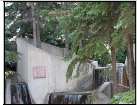
Century Gardens, 2007

Century Gardens is located in downtown Calgary and can be defined as an expressionism designed park with associated brutalism elements. The 0.5 ha (1.25 acres) park dates from 1975 and was donated to the City of Calgary by the Devonian Foundation as a way to celebrate Calgary's Centennial. The park design was a symbol of Calgary's growth and maturity - the modern form expressed the forward and innovative thinking of Calgary's citizens (Calgary Herald, 1974). The design of Century Gardens was inspired by the nearby Rocky Mountains. The concrete work represents the mountains and, along with the