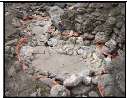
Pond Rehabilitation work, 2004

The historic water features at Reader Rock Garden were designed as a way of irrigating the adjacent beds. The upper pond would be filled and water would continue down the slope to the lower pond to fill the lower pond. The water would continue to flow, saturating the soil and irrigating the surrounding beds. Historically the system was not recirculating and excess water would continue to flow down the slope and off the site. The Environmental Considerations in the Standards and Guidelines encouraged the repair of existing leaks and the installation of a new, recirculating system.