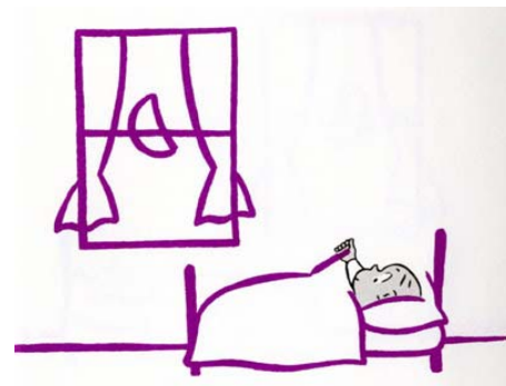
Figure 1. Harold draws his blanket [1]

Children have untamed imaginations. They often play in their own make believe world with imaginary characters and objects that they have constructed and conceptualized. This form of pretend play helps children nurture their creativity as they mentally augment physical settings and props. In the children's story, Harold and the Purple Crayon [1], Harold uses a simple crayon to augment his world (Figure 1). He is able to draw entities which instantly become real and can be interacted with as physical objects. This manifestation of pretend play is the inspiration behind our Purple Crayon . By combining virtual entities and tangible interaction, children can draw desired objects and immediately play with them in a physical manner. In this electronic entertainment environment, the approach of replacing abstract controls with intuitive physical interaction is demonstrated. The goal is to provide an entertainment environment in a domestic setting where social interaction is encouraged. Children are ideal participants in this exploration because abstract controls are often difficult for them to learn and retain, and it is important for them to participate in social interaction which benefits their development.