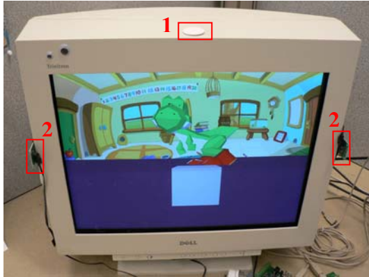
Figure 3. Play stage setup with RFID tags (1) and touch sensors (2)

PCs with monitors, large wall displays, and notebook computers are used. Each display must also have RFID tags attached to enable the transfer of virtual entities. Various Phidget sensors are also placed on or near displays to enable physical interaction including touch sensors, light sensors, motion sensors, and RFID readers. Some displays were setup with mixed reality capabilities, using a web cam and a set of mixed reality markers as additional interaction handles.