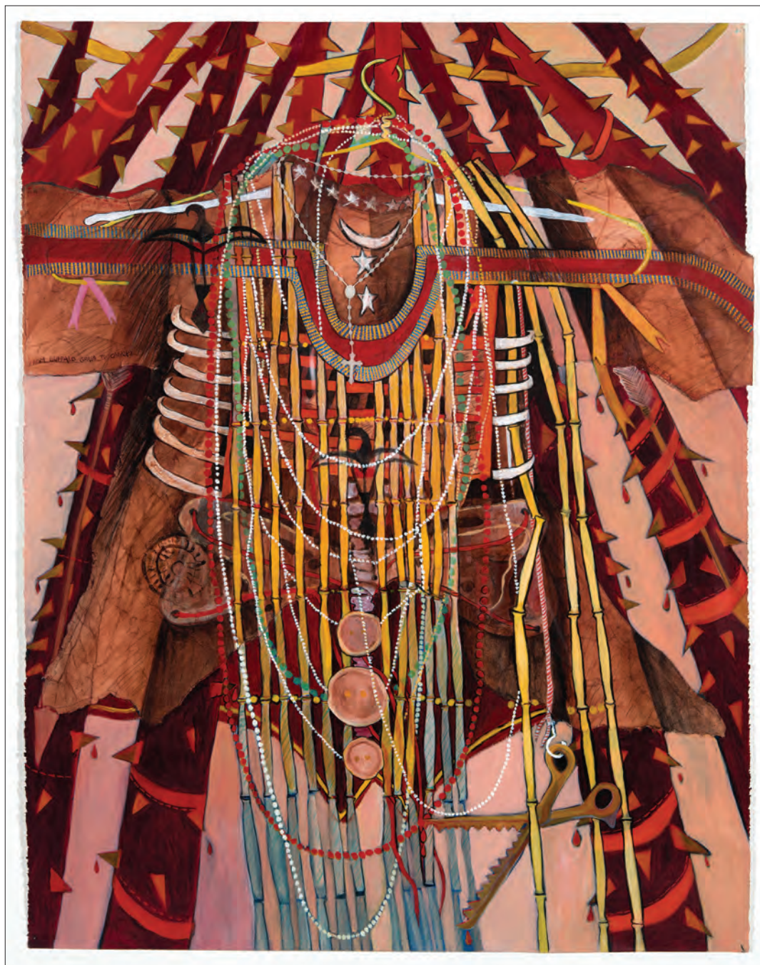
2. Self Portrait Warshirt , n.d. 152.4 x 101.6 cm 60" x 40" Mixed media on paper From the Estate of Joane Cardinal-Schubert