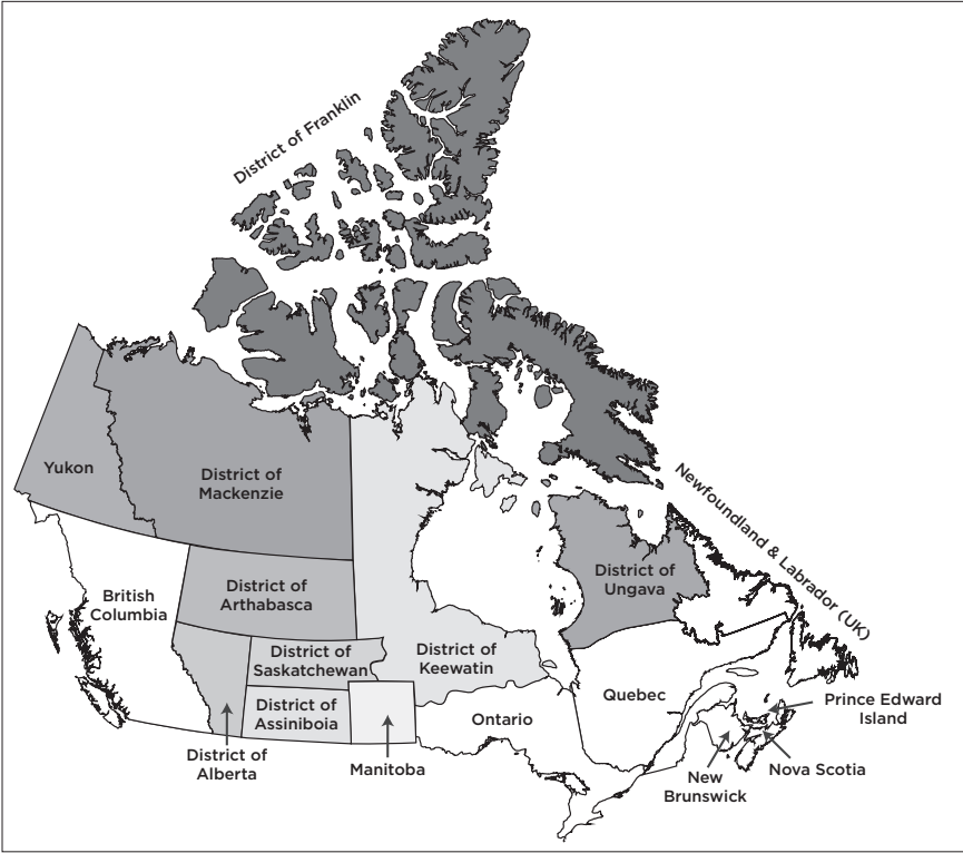
Fig 11.1 Canada at the beginning of the 20 th century, before the federal government created Alberta as well as Saskatchewan, and extended the northern boundaries of Manitoba, Ontario, and Quebec. Developed from Natural Resources Canada, “Map 1898,” Library and Archives Canada , https://www.collectionscanada.gc.ca/confederation/023001-5009-e.html .