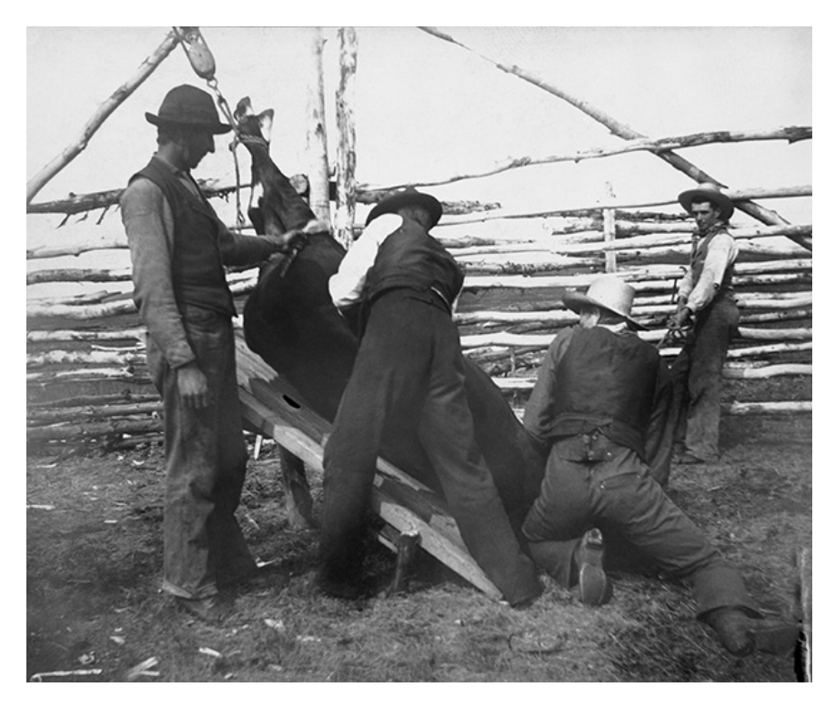
FIGURE 4.3. Spaying heifer on scaffold, Maple Creek area, Saskatchewan, 1897. Glenbow Archives, NA-3811-96.

The Canadian government and, presumably, a lot of the other western beef producers, were thankful to those who diverted trade to Britain because it took some of the pressure off the North American market and for a while at least seemed to support prices. Following is a transcription in the Macleay family papers of a letter from the Department of Agriculture to Rod Macleay.