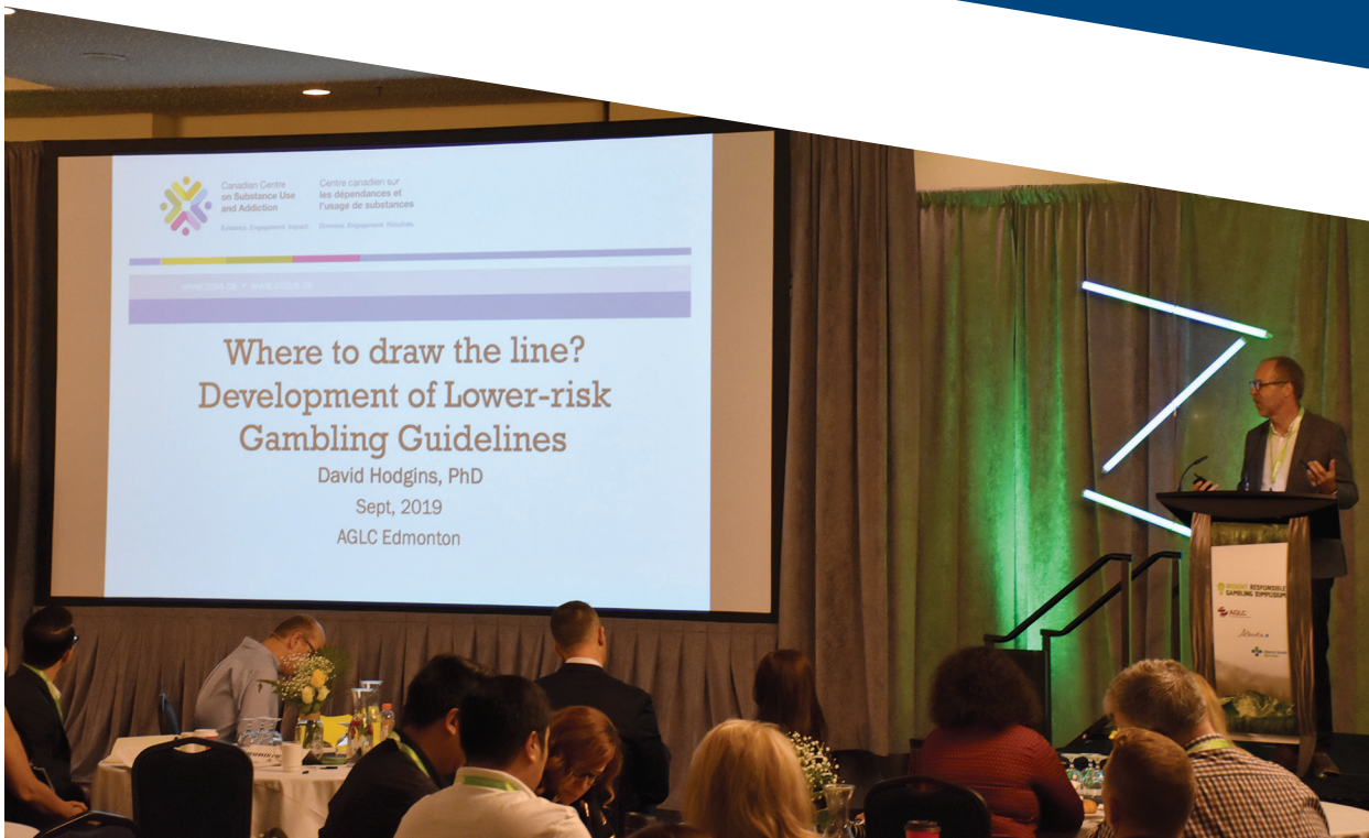
The AGLC's Insight Responsible Gambling Symposium took place on September 24, 2019 in Edmonton.