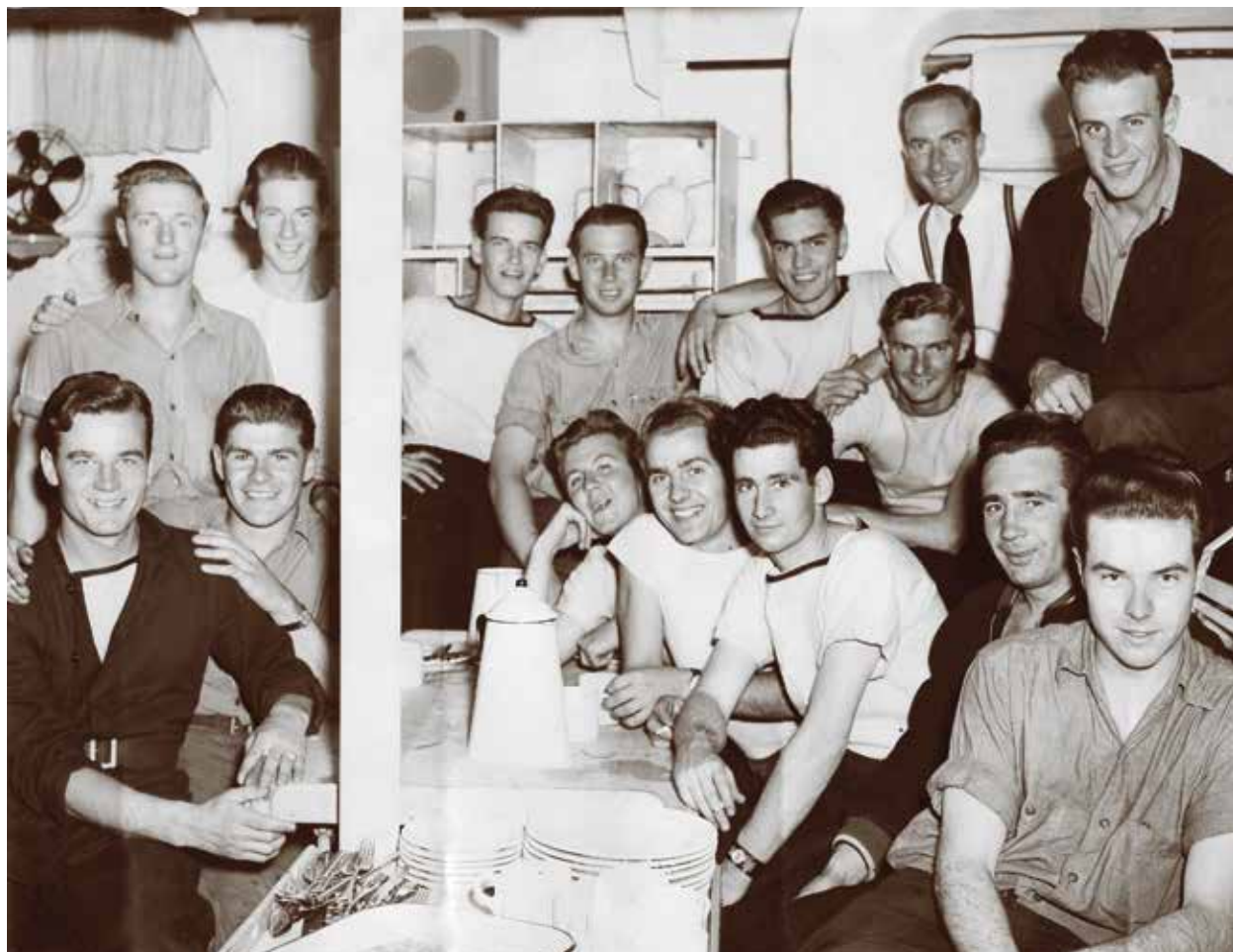
Crew members on the mess deck of HMCS Winnipeg , an Algerine-class minesweeper that served in the Royal Canadian Navy during the Second World War.