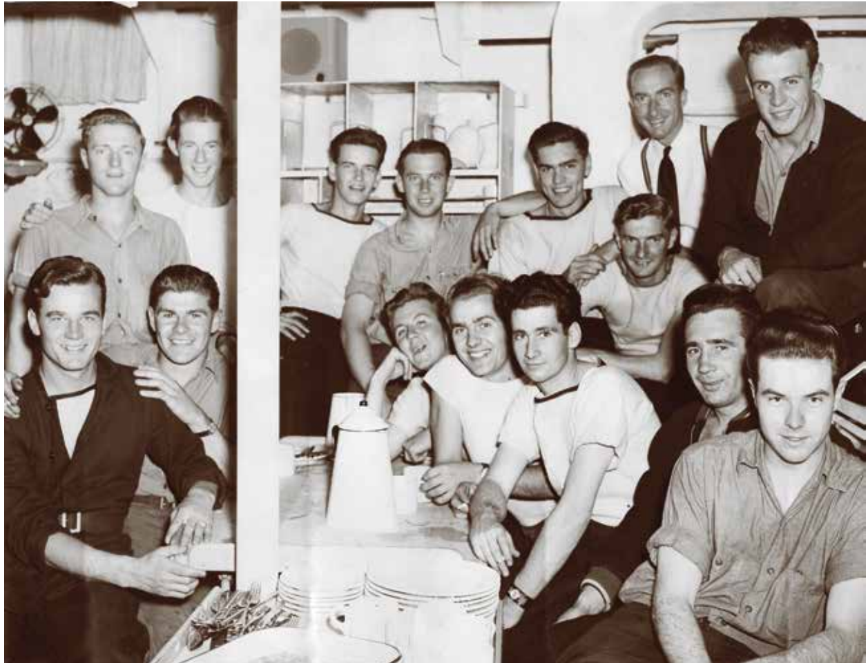
Crew members on the mess deck of HMCS Winnipeg , an Algerine-class minesweeper that served in the Royal Canadian Navy during the Second World War.