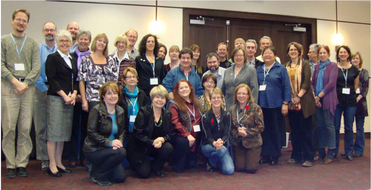
Picture from the last day of the Third Working Conference on Research in Teacher Education in Canada Winnipeg, 7 November 2009

Foremost, we like to acknowledge our colleagues who were involved in this writing and working project that we have proposed in the spring of 2009 and who came to Winnipeg from across the country to engage with their colleagues' ideas concerning field experiences in face-to-face working sessions. The number in which our colleagues responded to the project and the enthusiasm with which they participated has very much delighted us.