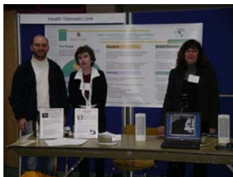
Core Facilities Open House

The Telehealth Program was invited to participate in two events at the Faculty of Medicine: 1) Arthritis Awareness Day; and 2) Core Facilities Open House. We had many visitors to our booths during these events, which provided an awareness around the Telehealth Program Research, Training, and Service opportunities.