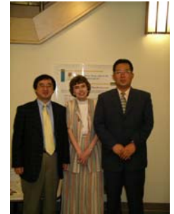
Samsung Visitors from Korea