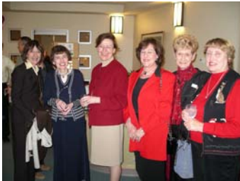
HTU Holiday Open House