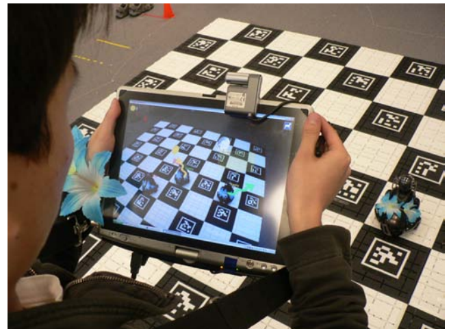
Figure 3: Human player looking at robot suggestions while surveying the mixed reality game environment

For the human player to make suggestions or cast votes, a more direct approach is taken. Unlike the first iteration where human players can use the keyboard to type votes to the rest of the team in a text chat interface [13], the handheld mix reality interface is not practical for typing since the tablet PC must be supported by the human player using one hand. Therefore, a click and drag interaction technique is used, where in order to make a suggestion or cast a vote, the human player can click on the square occupied by one of the wolves displayed on the screen of the tablet PC and then drag a mixed reality representation of the physical wolf to the destination square with the pen (Figure 2). This selection in 3D is achieved by inverse projecting 2D pen movements into 3D movements on the plane representing the checkerboard in 3D space, since the position and