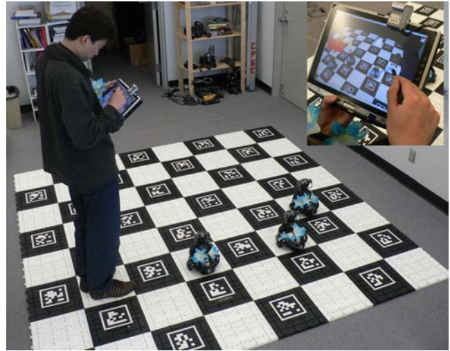
Figure 1: Sheep and Wolves collaborative Human-Robot Interaction testbed

Copyright 200X ACM X-XXXXX-XX-X/XX/XX ...$5.00.