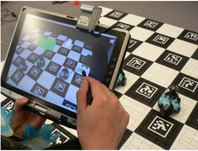
Figure 2: Human player interacting with robot teammates using a handheld mixed reality interface

to relate the position and orientation of the webcam to the markers by providing OpenGL projection and modelview matrices for proper rendering. Multiple markers are used to obtain stable tracking and to deal with partial occlusion of the checkerboard by human or robot players. Since all the game pieces can only move diagonally in the game, they can only occupy squares of the same colour. For example, if the game starts with the Sheep and Wolves on the white squares of the checkerboard, then they can never make a legal move onto the black squares. Therefore, we have chosen to place sixteen markers on only the black squares of the checkerboard and play the game always on the white squares. This gives an even coverage of the checkerboard, and tracking works well regardless of where human players are looking at on the checkerboard. Stable tracking allows human players to freely move around and explore the checkerboard, making the fusion of the physical and digital worlds appear natural.