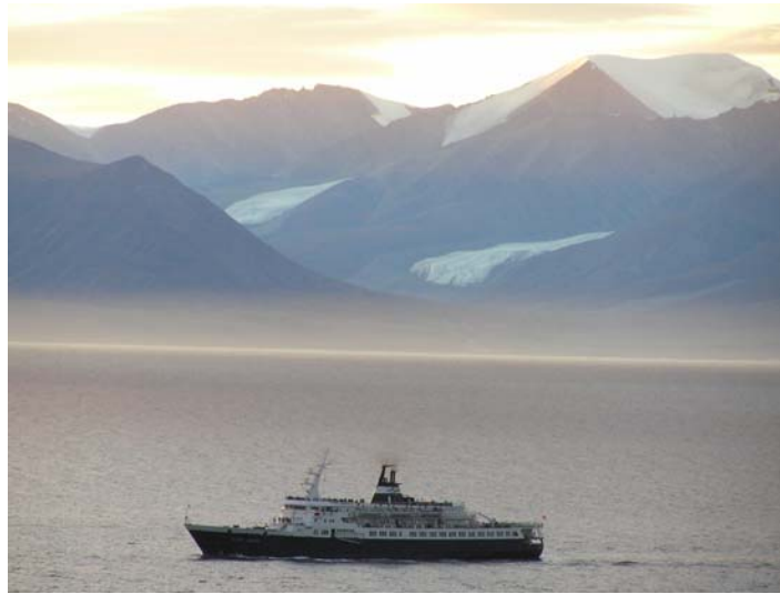
Figure 2: The Lyubov Orlova visiting Pond Inlet with Sirmilik National Park in the background, August 2007.

According to information from Nunavut Tourism, 9 cruise ships were expected to visit Pond Inlet in 2007 including the Lyubov Orlova, owned and operated by the Inuit of Nunavik (see Figure 2). The community of Pangnirtung, one of the main entry points into Auyuittuq National Park, anticipated 4 cruise ships in 2006 and, according to information from Nunavut Tourism, expected 7 vessels in the 2007 summer season. Auyuittuq National Park was identified explicitly as a destination on 4 cruise itineraries, although it is unknown how many visitors actually disembarked. Qikiqtarjuaq (formerly Broughton Island) which lies just outside the boundary of Auyuittuq National Park, expected to host 2 cruise vessels in 2006, and according to Nunavut Tourism, anticipated the same number in 2007 5 .