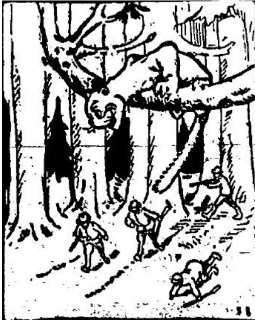
Figure 4.) Cartoon depicting the Stanley Park cougar hunt. Source: Vancouver Daily Province, 27 October 1911, 1.