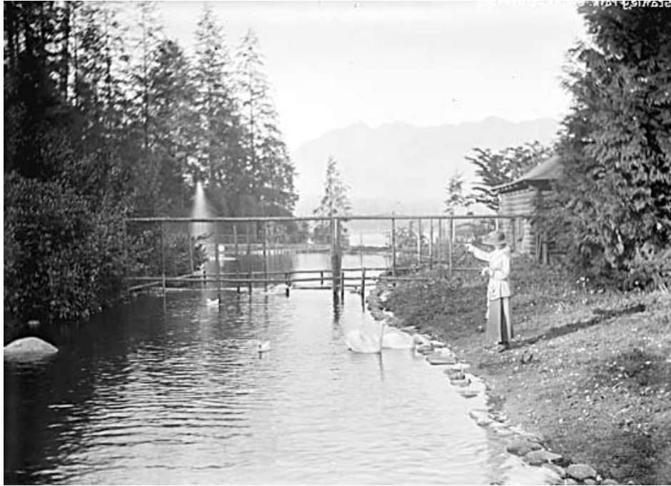
Figure 2.) The ornamental swan ponds were a popular attraction in the early years of Stanley Park drawing many to stop by the shores to feed the birds. However, these picturesque ponds were also the sight of significant carnage as the unwanted wildlife of the park, including crows and racoons, preyed upon the swans and their young.