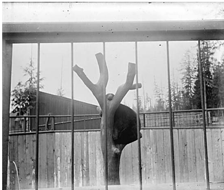
Figure 3.) For many years, the bear pit and the monkey house (shown in the background) were two of the most popular attractions in Stanley Park. Visitors could enjoy the splendour of wilderness in Stanley Park, but at a safe distance in a controlled setting. Source: Major Matthews Photograph Collection. St Pk P288.2N173.2