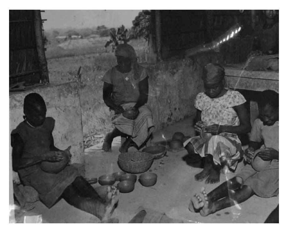
Girls making pottery products at a Catholic Community Development Center.

the knowledge that there is no future on the land for the majority. The third or fourth son knows that his chances of inheriting the father's farm are slight." He also alluded to the population density in parts of Igboland and the difficulties of surviving on farming in such areas where land hunger remained the greatest source of litigation in the Native Authority courts. In parts of Owerri Division, with an estimated population as high as 1,000 per square mile, the drift from the land "is sheer necessity," this official argued. In his view, "The productivity of the land cannot be significantly increased without capital, and this will not be available in sufficient amounts until a smaller farming population is able to win a reasonable surplus from its land and efforts."