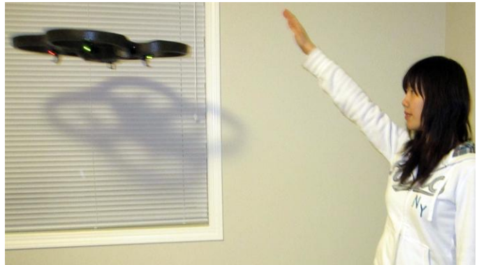
Figure 1. Using a gesture to tell the A.R. Drone to fly higher.

When a flying robot is far away from the user, a social disconnect is inevitable. However, when communicating with a flying robot within the same locality we believe that the natural instinct is to engage with the robot using either speech or body gestures, similar to how people engage with other collocated people or animals.