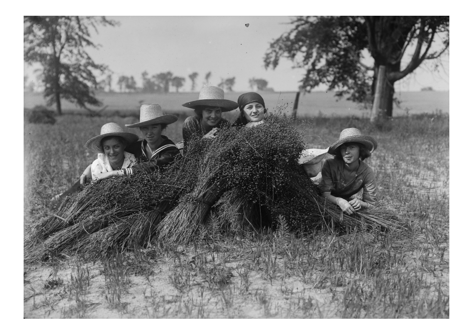
The wartime influx of "farmerettes" into rural areas was undoubtedly welcomed by lonely farm boys.

sweethearts at the front, describing their experiences on the job, did not survive. But we do know a few things. We know that new relationships were formed, sometimes of an illicit nature, as between factory men and female co-workers with husbands overseas, and that bosses sometimes caught male and female munitions workers "fooling around" on site.<sup>73</sup> We know that men sometimes made advances on women in their new positions. An article in Kingston's Daily British Whig on female streetcar conductors, for example, observed that "they are very business-like in appearance, and in the performance of their duties they will stand no nonsense from any of the male passengers who are of a 'flirty' nature, which responds to the attractiveness of the Limestone City's conductorettes."<sup>74</sup> And we know that the patriotic efforts women made – both as paid employees and as volunteers – drew the admiration and romantic attention of many men. "I would like