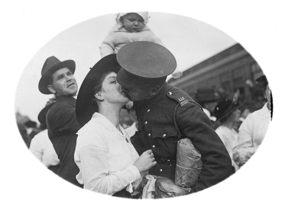
A Toronto soldier kisses his girlfriend (or possibly wife), goodbye at the train station.

By their eagerness to enlist and their lack of remorse, Canadian men proved they were as willing as Canadian women to put their nation's interests ahead of their romantic interests.