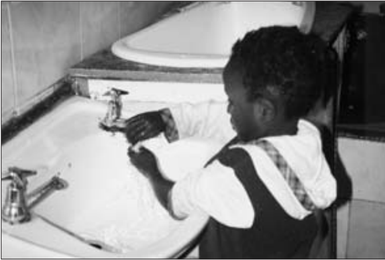
Child in Aids Orphanage near Durban, KwaZulu-Natal.

has become increasingly apparent over the past several years. Poor people are less likely to have access to educational program relating to the spread of HIV/AIDS or to be able to pay for medical treatment. Moreover, malnutrition contributes both to the effectiveness of medications and to the recovery rate of HIV/AIDS patients.