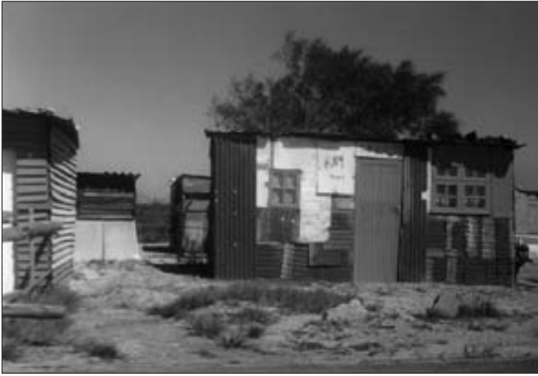
African homes in Khayelitsha township near Cape Town.

to be built in the first five years. Not only was this target not met, but the RDP houses (labeled “kennels” by the residents) were also often even tinier than the “matchbox” houses built for urban Africans in the apartheid era. Financial restraints have seriously affected almost every sector. The government’s answer was the GEAR program (Growth, Employment and Redistribution), which replaced the RDP in the late 1990s. This new policy, which focused on markets as the key instruments of development, was welcomed by the investment and business sectors, but did little to relieve the misery of the poor.