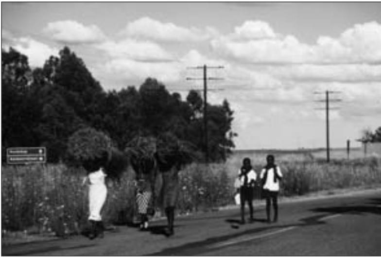
African women carrying firewood, Gauteng.

surveys of rural households found that the sale of crops amounted to less than 10 per cent of household incomes. However, more recent studies show that the contribution of agriculture to rural households has been underestimated. In some areas, crop sales may represent as much as 20 per cent of a family's income. Livestock farming is another important source of livelihood for rural families. The ownership of cattle and other livestock was a key element in the pre-colonial economies of African people in southern Africa and has remained so. The range of livestock farmed today includes cattle, sheep, goats, horses, donkeys, pigs, chickens, geese, turkeys, pigeons, rabbits and ducks. By keeping this type of livestock, rural families are able to obtain: meat, milk and eggs for home consumption; equity as an investment; income from the sale of animals or by-products such as hides and skins; the means to pay lobolo or bride-wealth, and cow dung (used to line the walls and floors of their huts). The horses and donkeys are also useful for draught or transport purposes.