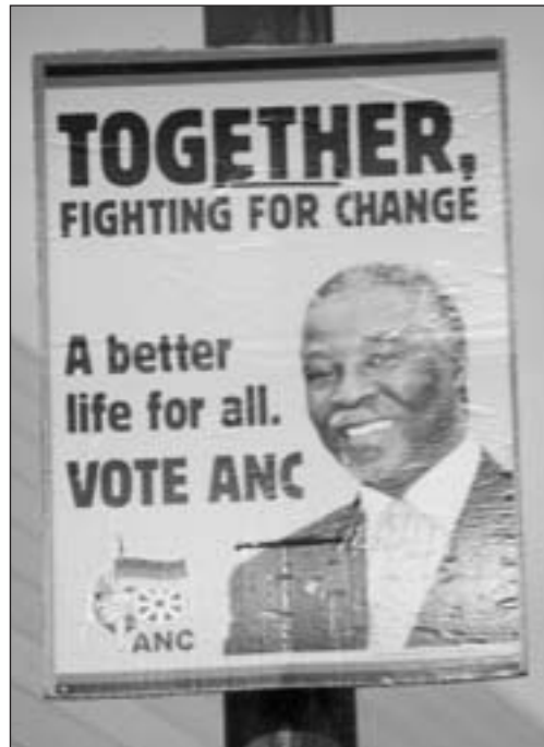
African National Congress election poster, 1999.

land would belong to all who worked it, and all the major monopolies, the mines and financial institutions, would be nationalized. However, Mandela and his colleagues were forced to abandon these communistic ideals and to support the continuation of a market economy. As Pilger observes, this was nothing new. Under white rule, there had been a long and bloody history of a market economy in South Africa. Cecil John Rhodes paved the way in the late nineteenth century, advocating the dispossession of Africans and their “removal” to cheap labour reserves for white-owned gold and diamond mines and industries. The Oppenheims followed in Rhodes’ footsteps and grew rich on the brutal migrant labour system. 10 In post-apartheid South Africa, Harry Oppenheimer’s theory of “trickle down” wealth has been adopted by President Thabo Mbeki and his Minister of Finance, Trevor Manuel. While this policy favours the development of a small black elite, it has not addressed the enormous legacy of poverty the ANC government has inherited. 11