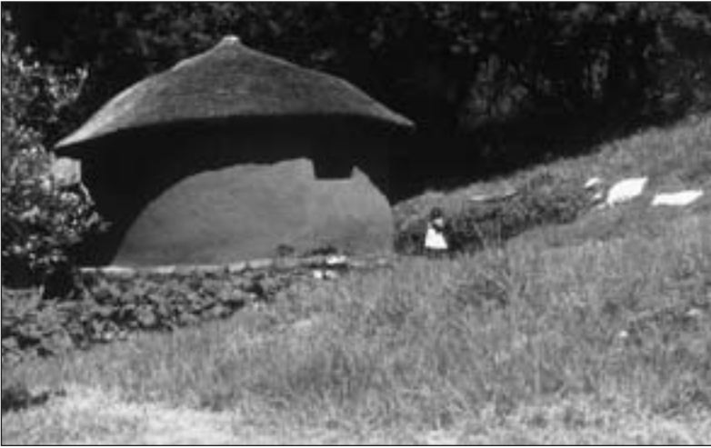
Rural African home near Nylstroom, Northern Province.

and European populations. President Mbeki's characterization of South Africa as "two nations" – a rich nation (mostly white) and a poor nation (almost entirely black) – is totally appropriate.