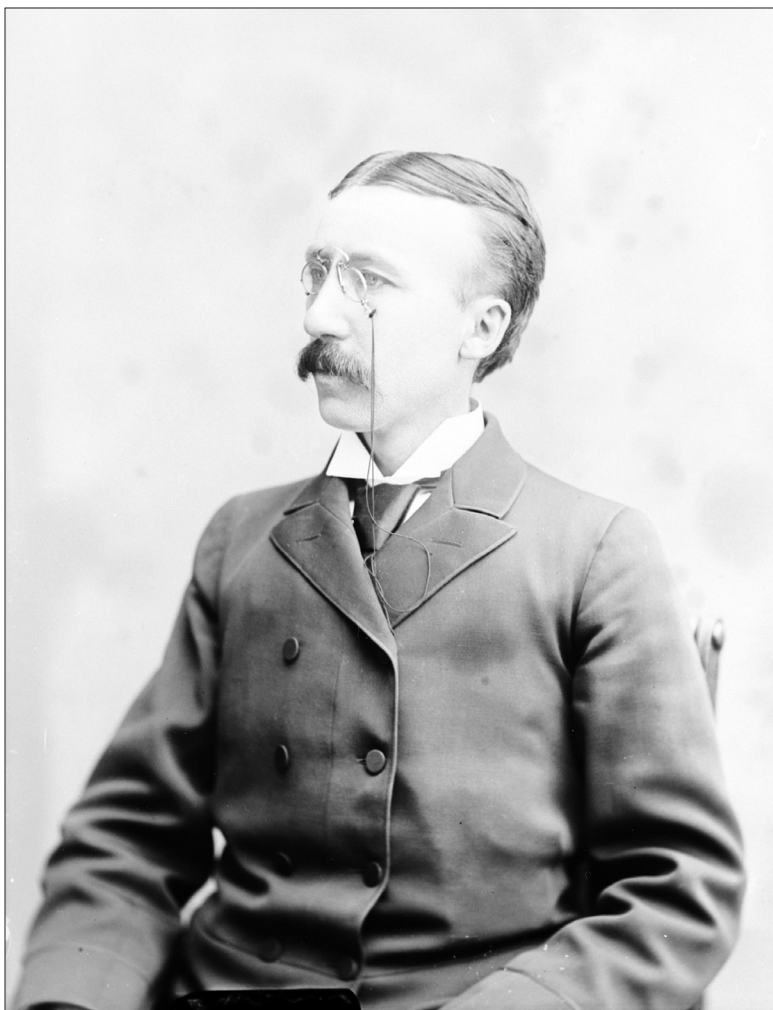
FIGURE 8-1: HON. PASCAL POIRIER, SENATOR, MAY 1892. TOPLEY STUDIO FONDS / LIBRARY AND ARCHIVES CANADA / PA-033713.

islands in the northern hemisphere. It should be added, of course, that some of the Antarctic sectors (notably the Australian, New Zealand, Chilean, and Argentinean) are located roughly south of the claimant states, but since the distances in between are approximately 500 or 600 miles at the minimum and several times as much at the maximum, it would appear to be stretching any “principle” based upon the sector concept rather far to assert a claim on that basis.