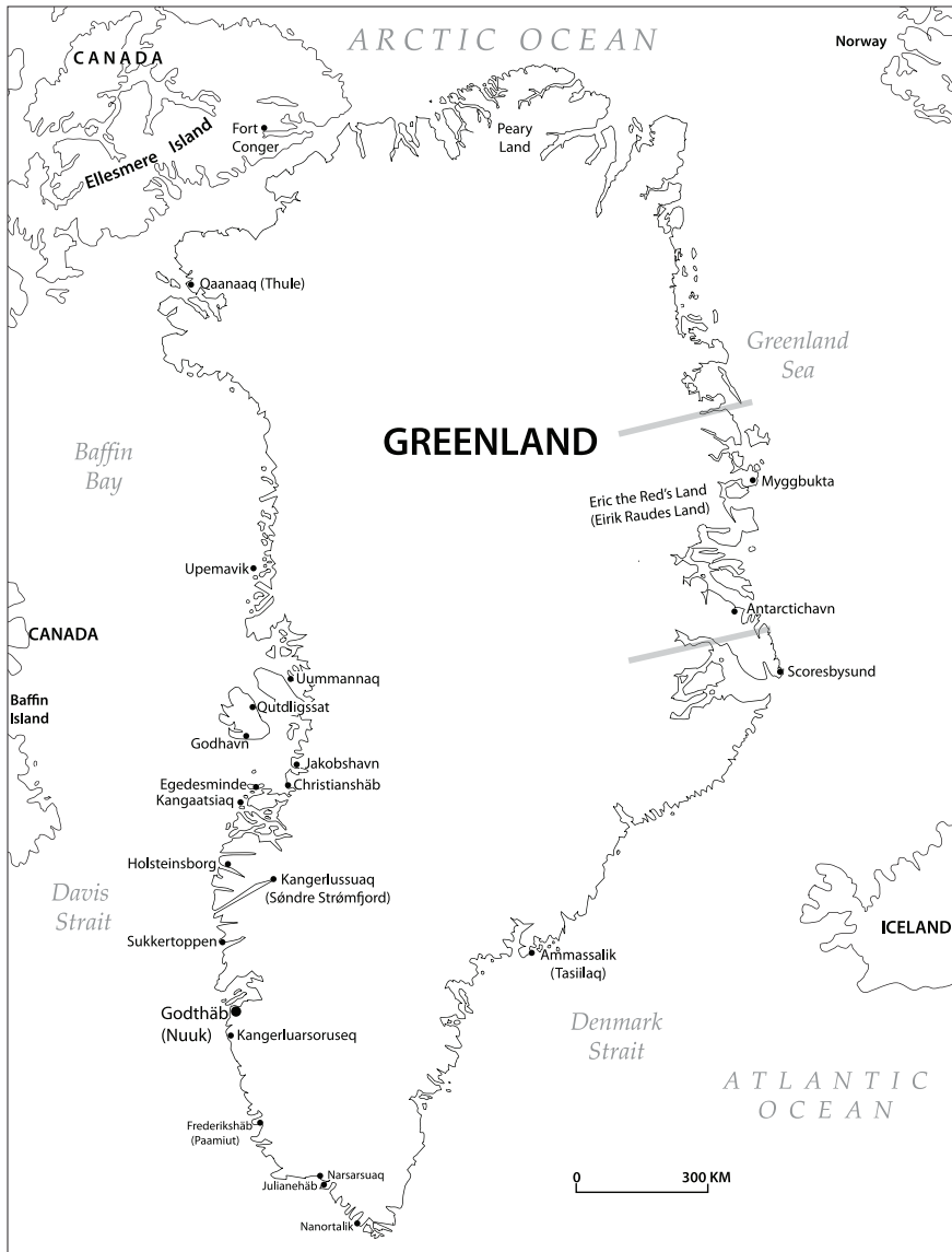
FIGURE 13-1: NORWAY'S CLAIM TO EASTERN GREENLAND.

decided to submit the matter to each of the principal Allied powers separately, 9 whose replies, taken collectively, did little to remove the ambiguity. 10 For its part, Britain's definitive response was delayed because its government believed that Britain's recognition should be qualified by a right of pre-emption granted by the Danish government in case Denmark should ever decide to dispose of Greenland (see chapter 10).