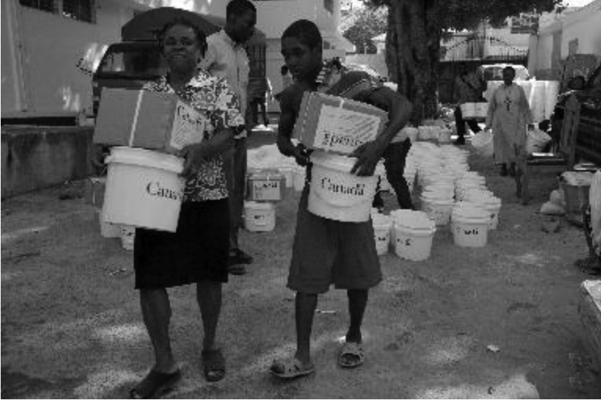
Figure 2: Following the massive earthquake of January 2010, Canadians rallied in support of Haiti. In this photo, a Haitian family receives an emergency cooking and water storage kit.

involved. Many Canadian faith-based and development organizations have deep roots in Haiti, and the country is an important source of talented francophone immigrants. More important, until the day comes when Haiti's problems no longer concern Washington, Canada will have little choice but to play a role in shaping the fate of Haitians, whether it wants to or not. As long as Haiti's instability is deemed to pose a threat to international peace and security, this tiny Caribbean island country that presents no direct danger to Canadian national security will remain a fixture of Ottawa's foreign policy.