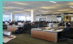
Figure 1. Indirect lighting, high traffic, social, collaborative

"The only time I find myself using these is if I need to do some last minute printing."