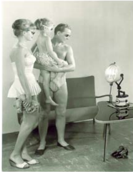
Figure 1: Advertisements for sunlamps were illustrated with photographs of healthy, sporty women, men and children in front of such medical devices.

Age and dreadful childhood disease caused by a lack of vitamin-D – in a Berlin children’s home in 1919 with the sunlamp “ Kuenstliche Hoehensonne ” (engl. “artificial sunlight”). 6 After this success, several projects were started in which paediatricians systematically irradiated babies with short-wave light rays for the prevention of rickets. 7 For this reason, the discovery of the role that ultraviolet rays play in vitamin-D synthesis to a certain extent explains why children had been irradiated for health care purposes. Some physicians exploited Huldchinsky’s healing success to advise regular use of sunlamps not only to the groups at-risk for