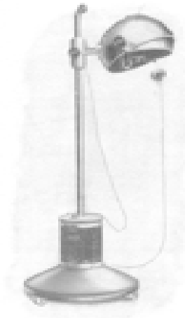
Figure 3: The “ Kuenstliche Hoehensonne ” was the prototype of those sunlamps which were sold for daily use at home.

The electric light bath produced heat and was also used as a sweat bath in bathhouses, sanatoriums and villas. 32 It consisted of a wooden cabinet in which fifty or sixty incandescent light bulbs were strung up. For irradiation, patients stood or sat in the wooden box. 33 In contrast, the “ Kuenstliche Hoehensonne ” emitted a cone-shaped beam of short-wave rays which permitted the irradiation not of the whole patient but of a large part of the torso. Its most important technical component was a so-called “quartz-burner”. This component was a tube of quartz glass, in which mercury vapour emitted short-wave rays if an electric potential was introduced. 34 The “ Kuenstliche Hoehensonne ” was the prototype of those