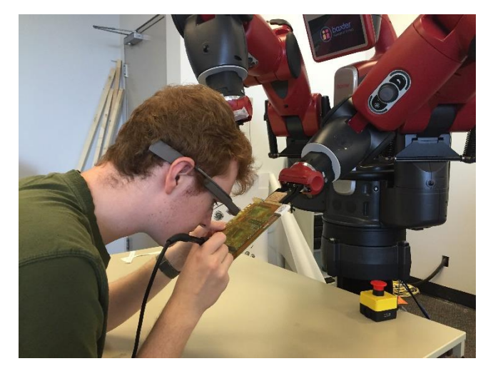
Figure 1. A user controls a robot to help them solder a circuit board, seeing the perspective from the robot's hand camera in Google Glass.

Each submission will be assigned a DOI string to be included here.