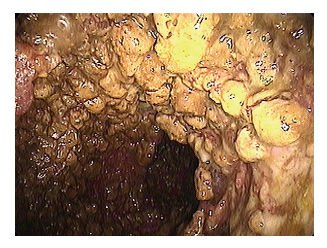
FIGURE 2: Pseudomembranes and pneumatosis coli. Endoscopic evaluation of the colonic mucosa reveals pseudomembranes. Cystic lesions are evident beneath the pseudomembranous layer.

3.1. Epidemiology. Pneumatosis intestinalis, rather than being a disease per se , better relates to the underlying pathological process that varies widely: from being quite incidental without symptoms detected on screening colonoscopy to