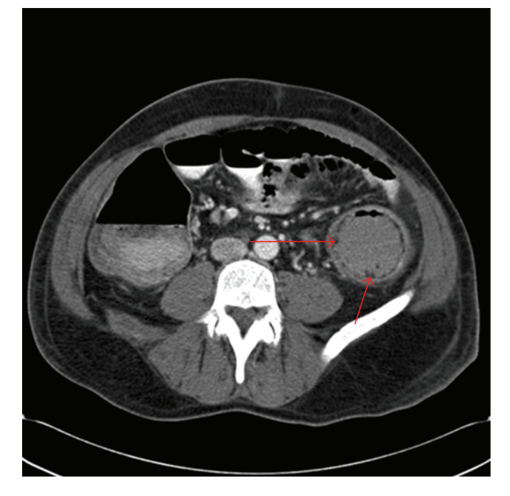
FIGURE 1: Abdominal computed tomography (CT) revealing submucosal air-fluid cysts. Arrows demarcate submucosal gas within the wall of the left colon, pneumatosis coli.