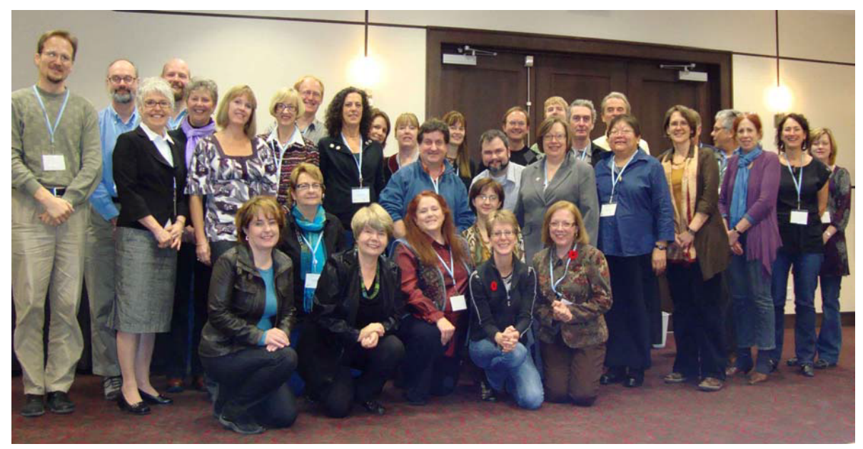
Picture from the last day of the Third Working Conference on Research in Teacher Education in Canada Winnipeg, 7 November 2009

Foremost, we like to acknowledge our colleagues who were involved in this writing and working project that we have proposed in the spring of 2009 and who came to Winnipeg from across the country to engage with their colleagues' ideas concerning field experiences in face-to-face working sessions. The number in which our colleagues responded to the project and the enthusiasm with which they participated has very much delighted us.