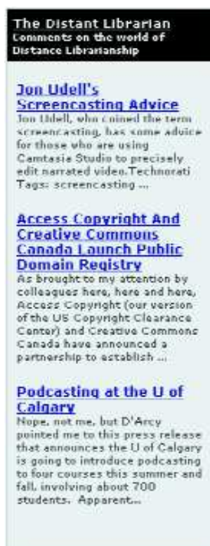
Figure 4: Stylized Preview 2