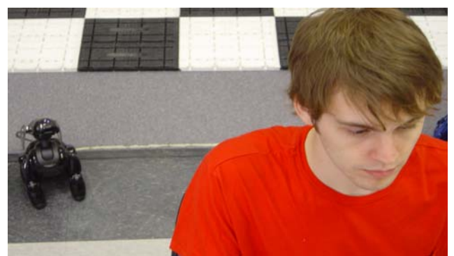
Figure 3. How AIBO Surrogate appears in the real world

The walk control , shown at the bottom of the tooltip grande as blue crosshairs and a robot dog icon, lets the person control the robot's movement. Clicking left or right of center controls how quickly the robot turns left or right. Clicking above or below the center controls how quickly the robot walks forward or backward. Clicking the center tells the robot to stop moving. Thus the controller can make the AIBO walk and turn in any direction by clicking and holding on a desired position. Control feedback of the current walk parameters is provided by the robot icon snapping to the mouse position and following the mouse as it moves. The robot maintains the target speeds until the person