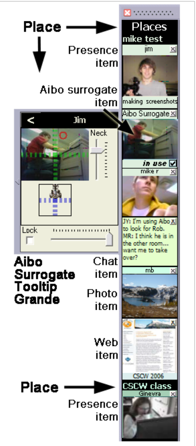
Figure 1. Community Bar: 2 places, a variety of media item tiles, and the AIBO Surrogate tile and tooltip grande.

Using Figure 1 as an example, the group sees through the tile view that the robot is currently in use, i.e., that it is being controlled by another group member. The chat also mirrors this interaction, where one person tells the other "I'm using the AIBO