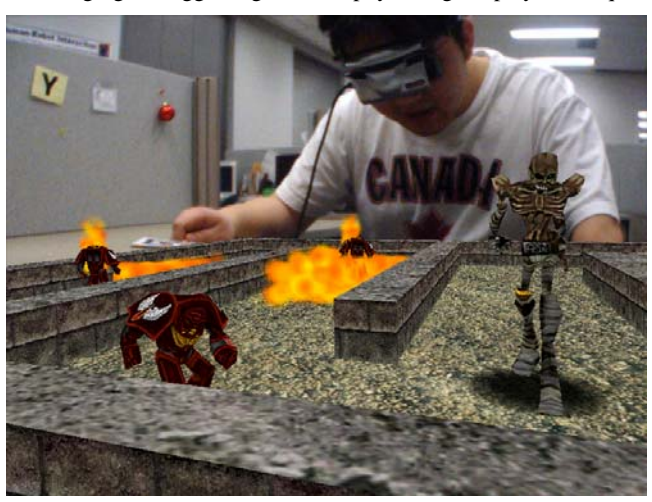
Figure 2: Playing Save 'Em using the head-mounted display.

Although a formal user study has yet to be conducted, a large number of players have already played the game in a casual setting. Thus far, observation of these players has been very encouraging in suggesting that the physical gameplay techniques