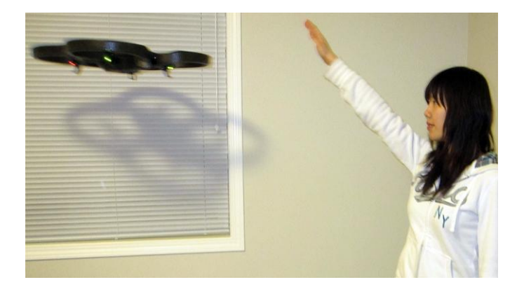
Figure 1. Using a gesture to tell the A.R. Drone to fly higher.

When a flying robot is far away from the user, a social disconnect is inevitable. However, when communicating with a flying robot within the same locality we believe that the natural instinct is to engage with the robot using either speech or body gestures, similar to how people engage with other collocated people or animals.