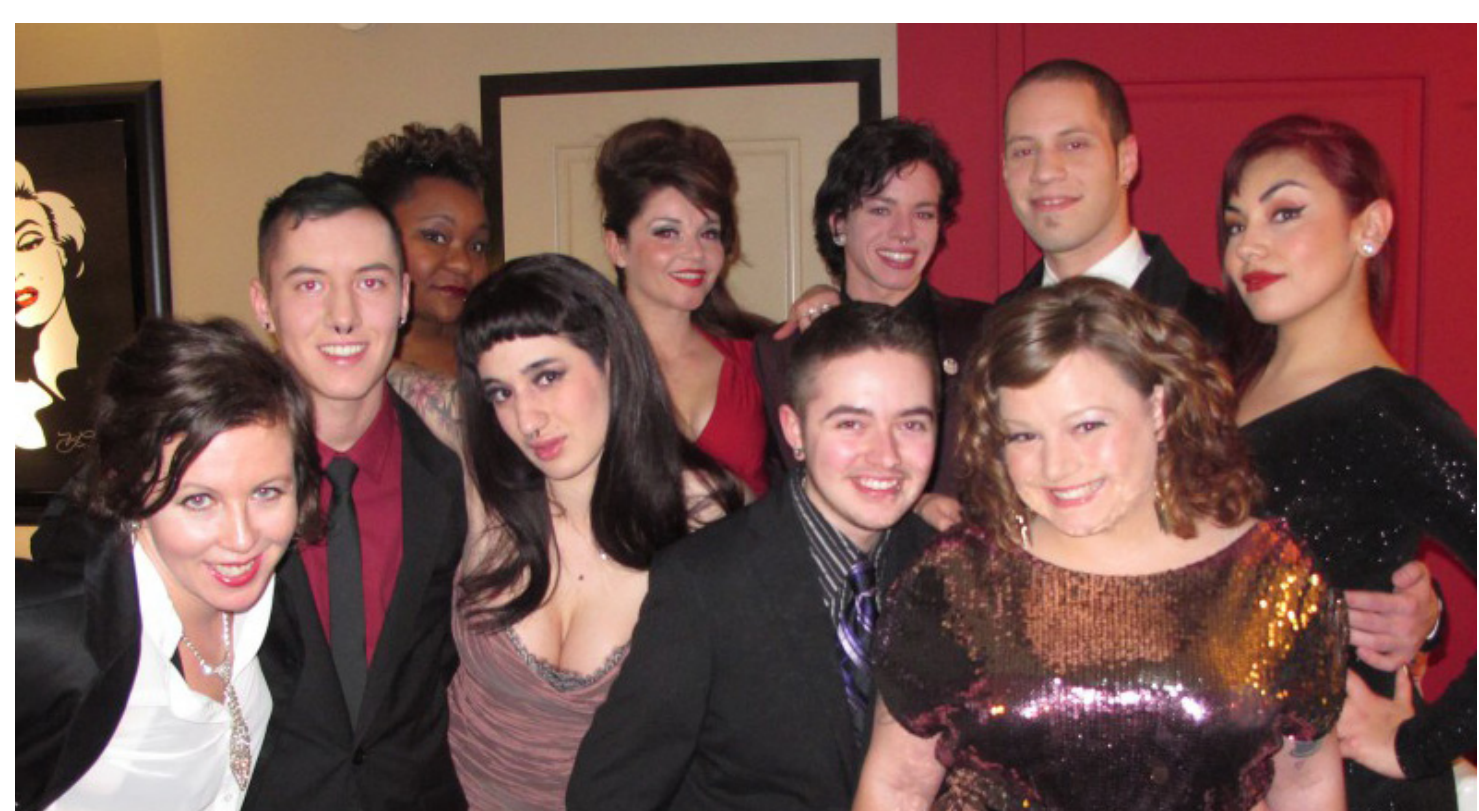
The 'deliciously diverse' cast of Fuckstyles of the Queer and Famous .

Rather than arguing against anti-porn feminist critiques, this research examines how feminist pornography presents a different 'theory' through the subversion or exclusion of key tropes, outlined below. Empirical data supporting the positive or negative effects of pornography is scarce (17, 2), and existing studies are problematic and incomplete (2). However, there is some evidence that pornography can normalize sexual behaviour (17, 14). If it is true that the damage caused by some porn is caused in part by portrayals of coercion, passivity, homogeneity and objectification, and that the corollary to this pornography as a theory is rape as a practice (12), then a different theory may result in a different practice.