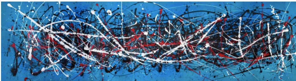
“Black and Blue and Red All Under”

[Sen. Ed. note: this volume's cover is a 'mash-up' digital collage of two original art works by Patrick Slattery, one a painting (Black and Blue and Red All Under) and the other a painting and assemblage (Metamorphosis)—originals can be seen at http://psartworks.com (Gallery); Patrick was kind to let me digitally manipulate his images, cropping, shifting color, layering to create the intriguing IJFS cover image.]