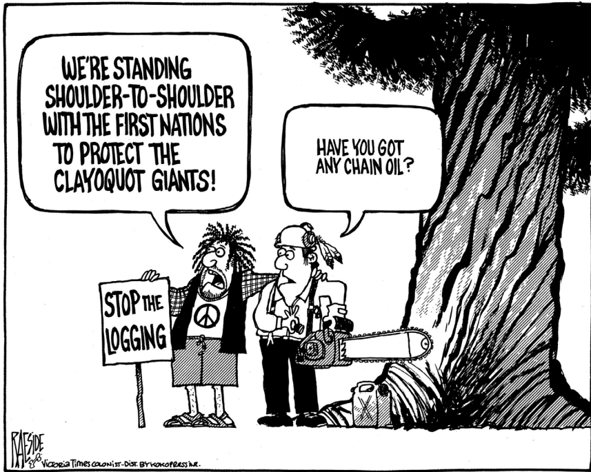
FIGURE 8.1: Adrian Raeside's editorial cartoons, here and in Figure 8.2, highlight the hypocrisy of environmental activists proclaiming support for First Nations while simultaneously attempting to control their actions with respect to resource use. Victoria Times Colonist , September 10, 2006.

anti-conquest via pledges to support Aboriginal rights and land management while decrying colonialism—to their advantage.