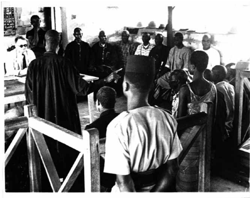
Chiefs sitting in court with a district officer.