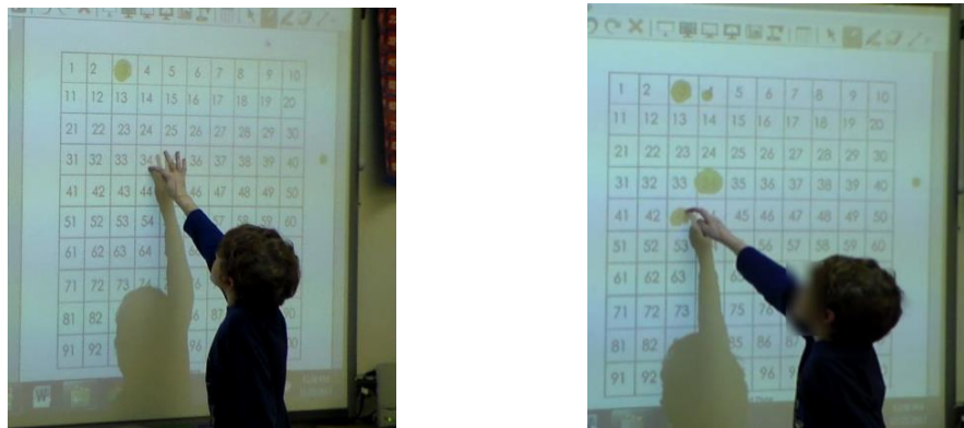
Figure 1: Identifying numbers before and after corrective measures.

The video recording data we gathered early in the project seems to indicate that teachers often employed traditional scaffolding strategies such as modelling, coaching, and giving advice. In one classroom video recording, we observed the teacher asking students to identify two-digit numbers on a 100s chart. The procedure was simple. The teacher spoke a number between one and 100, and the students found the number on their 100s chart. The teacher then randomly asked a student to come to the Smart Board and highlight the number that was read. In one occasion, the teacher asked the students to find “43” on their 100s chart. Then the teacher asked a student to come to the Smart Board to “find” the number 43, but the student highlighted the number “34,” as shown in Figure 1.