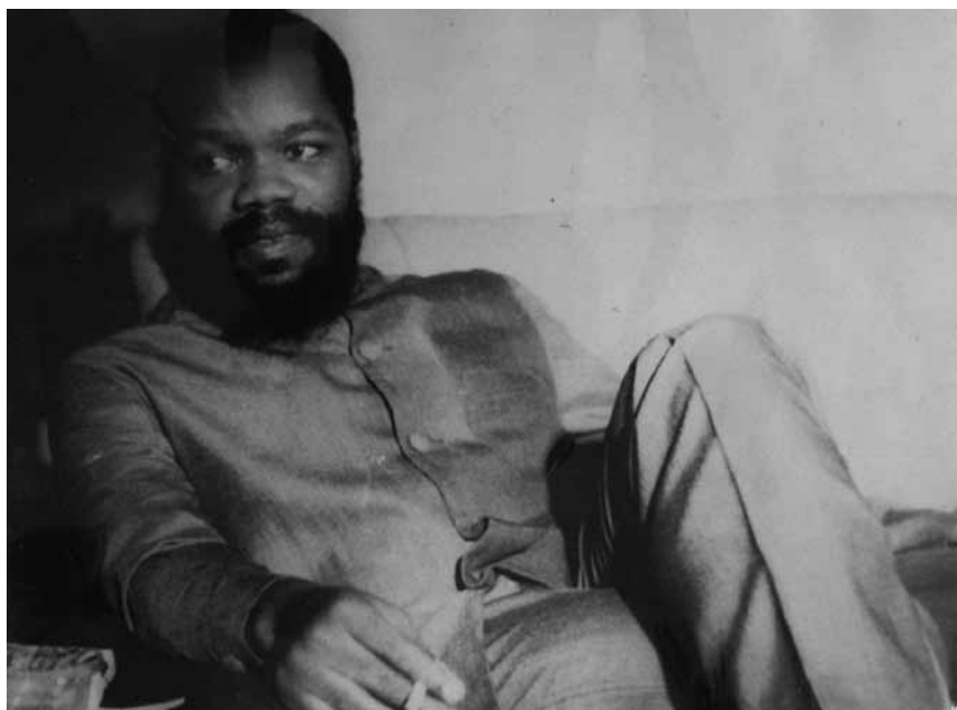
Col. Chukuemeka Odumegwu Ojukwu, head of state of Biafra.

land under the plantation program into farmland in order to increase food production and increase the potential for export.