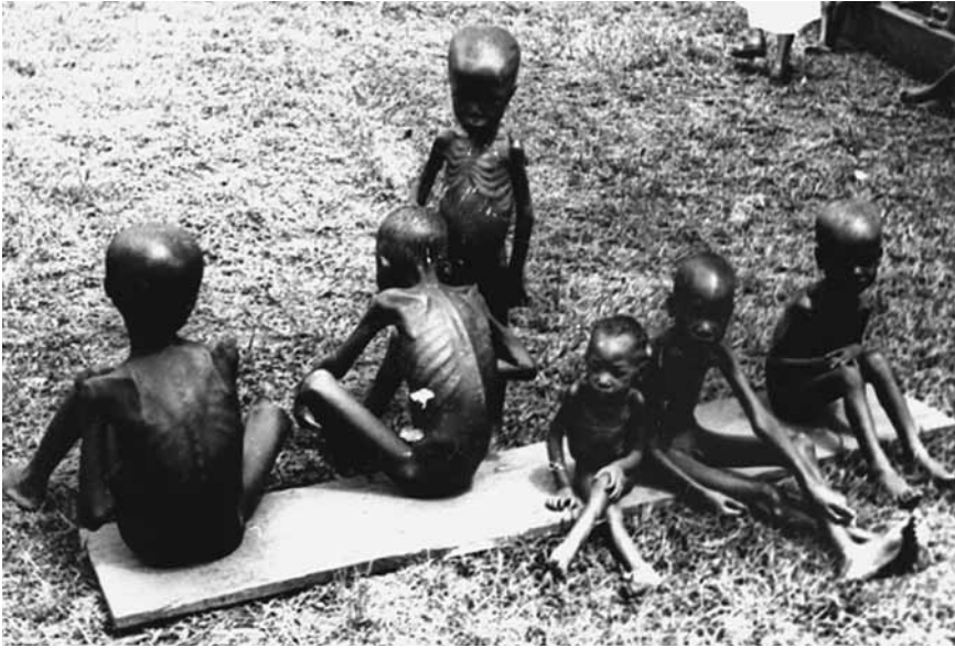
Starving Biafran children.