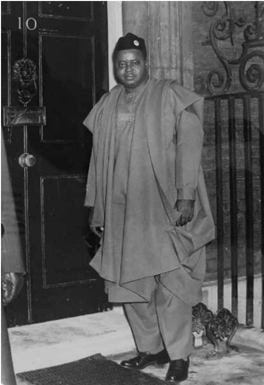
Dr. M. I. Okpara: The architect of the agricultural revolution.