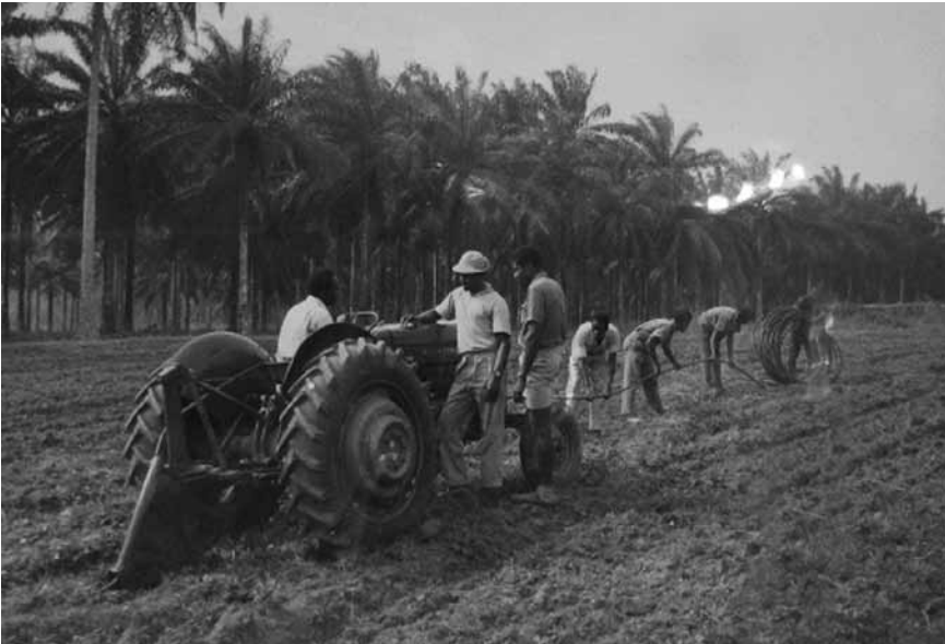
Tractor laying plastic water pipe at the Umudike Agricultural Research Station, 1963. PRO INF 10/250. (Reproduced from the library of the National Archives, Enugu.)