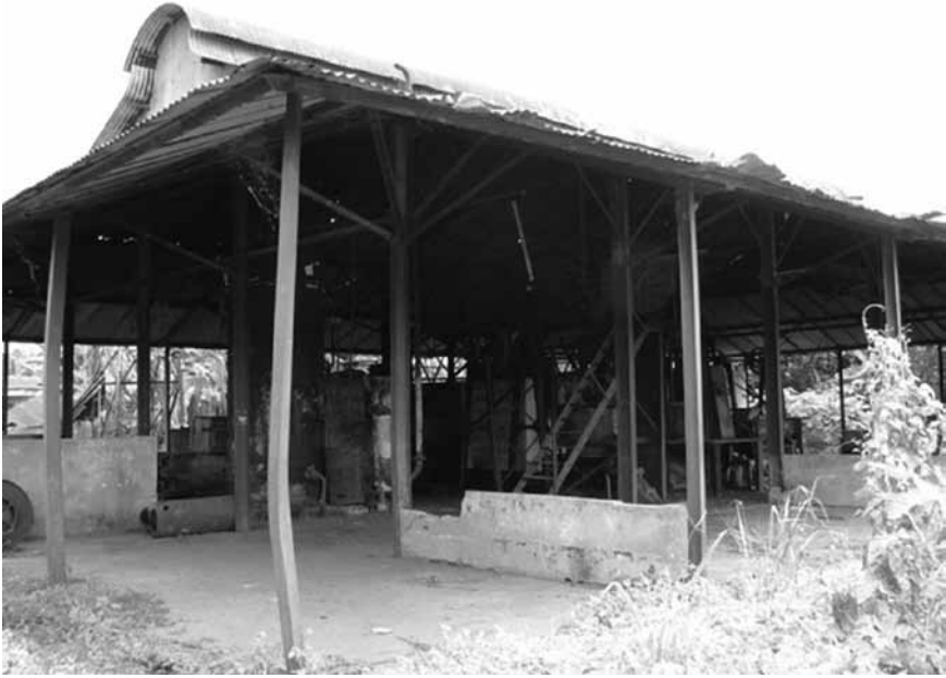
An abandoned oil palm mill at Owerrinta, Abia State.

wealth in Nigeria to have time or energy to invest in expanding or upgrading their cocoa farms. 171 The neglect of agriculture and dependence on oil combined to expose the fragility of the Nigerian economy and heightened class contradictions. 172 As Nicholas Shaxson has recently shown, the paradox of African oil is the enormous wealth it generates for a few, and the poverty and political and economic insecurity it brings for the majority in oil-exporting countries such as Nigeria. 173