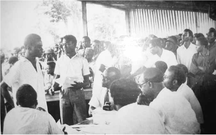
Prospective settlers being interviewed for admission to a farm settlement.

nearly half of the total outlay of the budget. This was not realized. 64 In addition, conditions in Eastern Nigeria were different from the conditions in Israel upon which the government modelled the settlement project. The success of farm settlements in Israel is related to the peculiar historical circumstances in which the members of the Jewish Diaspora found themselves. With little agricultural experience, the scheme offered them the opportunity to acquire agricultural skills in a new environment. 65 On the other hand, the Eastern Nigerian farmers already had centuries of agricultural knowledge and many years of commercial agriculture experience behind them, so the new system operated under different socio-economic conditions.