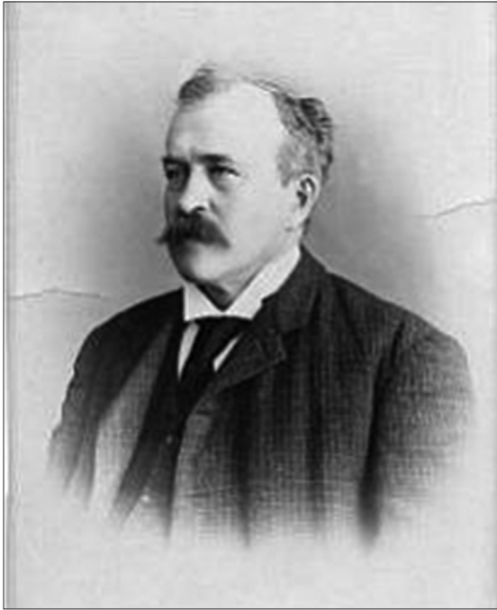
FIGURE 2-1: DR. W. F. KING. NATURAL RESOURCES CANADA .

Provided that the consent of a self-governing colony shall be required for the alteration of the boundaries thereof.