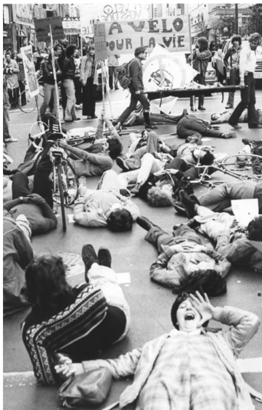
6.2 MAB members in one of the group's largest die-ins, on Saint Catherine Street in 1976. The banner reads "Bike for life," and in the background a cyclist is being carried off on a stretcher.

Quebec, the first wave of the new environmental movement—more radical than its conservationist predecessors and unafraid to draw links between environmental and social problems—was spearheaded from 1970 by anti-pollution groups (and MAB allies) La Société pour vaincre la pollution and the Society to Overcome Pollution (STOP). 28