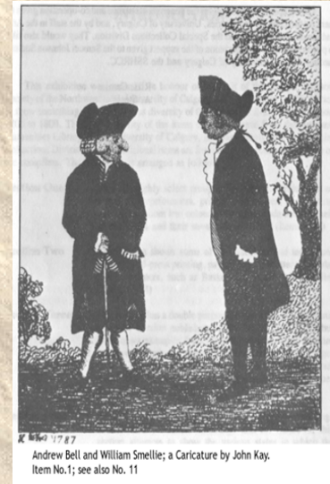
Andrew Bell and William Smellie; a Caricature by John Kay. Item No.1; see also No. 11

Ref. Straus. R., Robert Dodsley, poet, publisher and playwright , London, 1910.